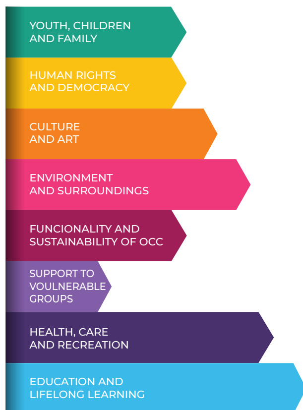
Chart no. 1 Areas of Support of Youth Program